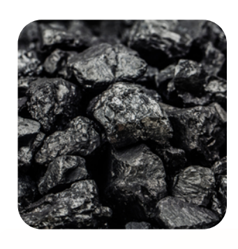
South African Coal